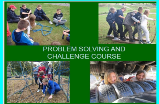
PROBLEM SOLVING AND CHALLENGE COURSE