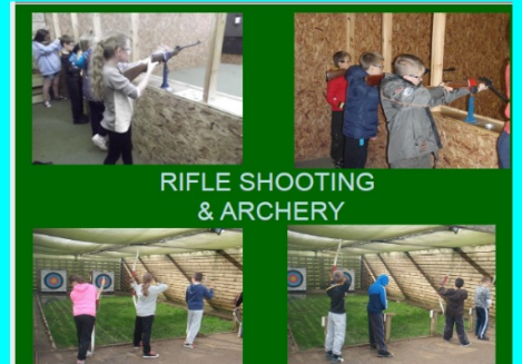
RIFLE SHOOTING & ARCHERY