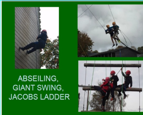
ABSEILING, GIANT SWING, JACOBS LADDER

Wednesday 17th September 2025 - Friday 19th September 2025